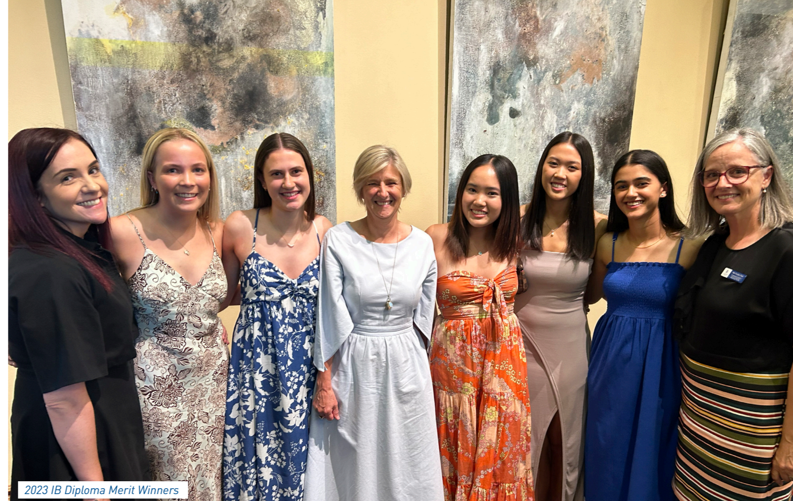
2023 IB Diploma Merit Winners

Subjects delivered depend on student numbers and resources. It is possible to study unlisted subjects. Speak to the IB Diploma Coordinator at the subject selection stage or earlier and we can investigate possibilities such as studying offline or joining a class in another school for that subject. If it is a language, the school will support the students to study Language A in their native tongue.