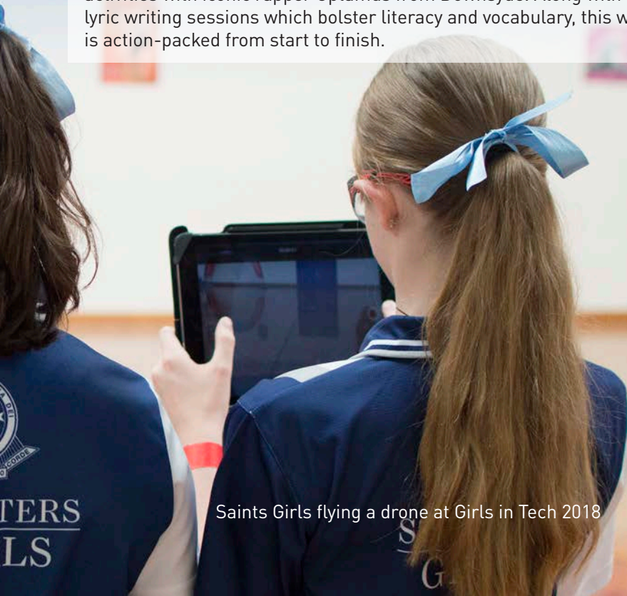
Saints Girls flying a drone at Girls in Tech 2018

Delve into the world of Music Technology during hands-on beat making activities with iconic rapper Optamus from Downsyde. Along with rhyming/ lyric writing sessions which bolster literacy and vocabulary, this workshop is action-packed from start to finish.